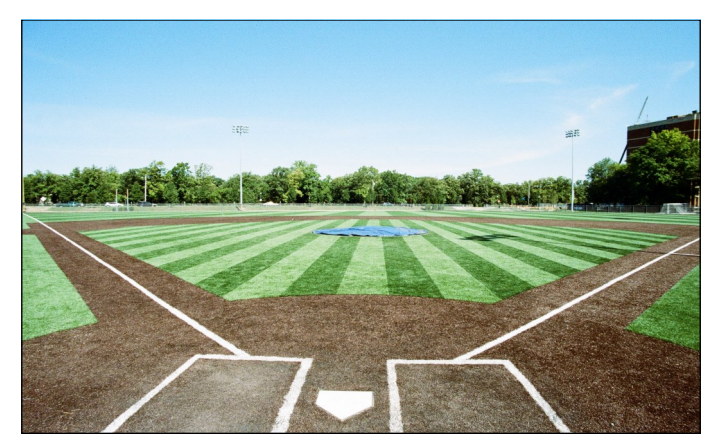
In 2012, the Rochester Baseball Program completed a $2.5 million renovation of Towers Field.